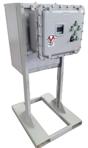
Volta "D2" Class 1, Div. 2 (Optional Class 1, Div. 1)