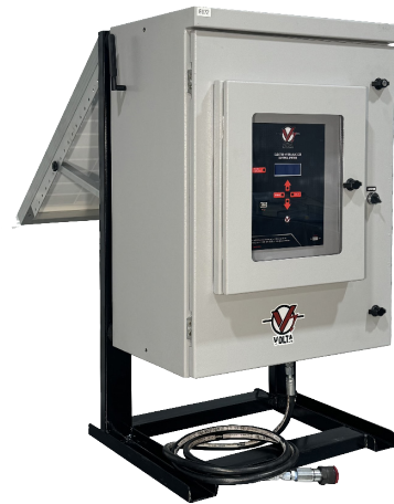
Volta Remote Mount NEMA 4