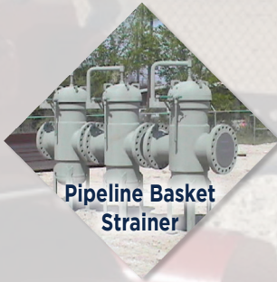
Jamison Products Strainers Tube Turns Closures Separators