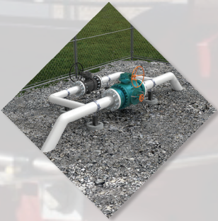
Chaoda Pigging Setup w/Bypass