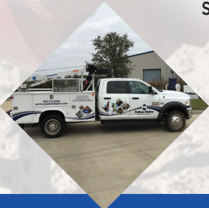
Field Services Commissioning & Start-Up Services, Field Retrofits, Valve & Actuation Repairs

281.256.0467 15002 Boudreaux Road Tomball, Texas 77377