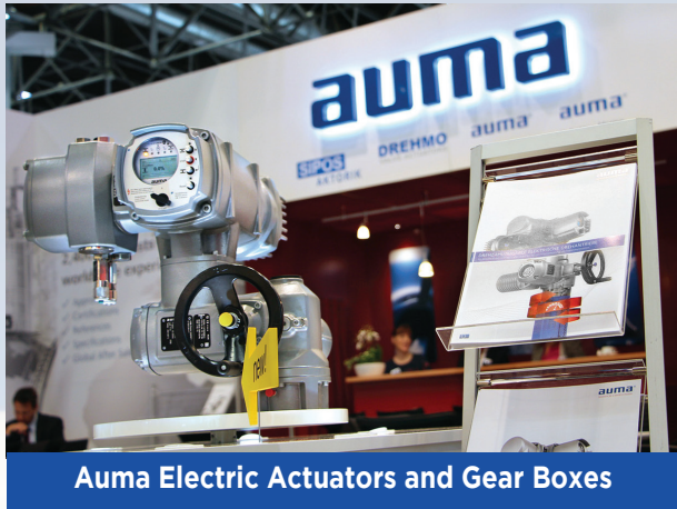
Auma Electric Actuators and Gear Boxes

Valve and Actuation Distributor with Extensive Inventory, Value Added Capability and Dependable Field Services.