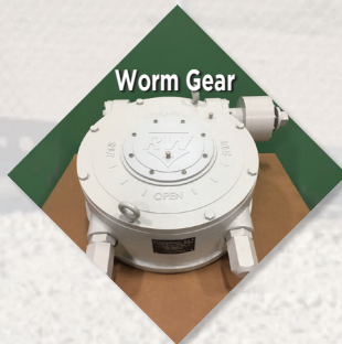
WedgeRock Worm Gear Actuator Planetary Gear Actuator ESD Actuation